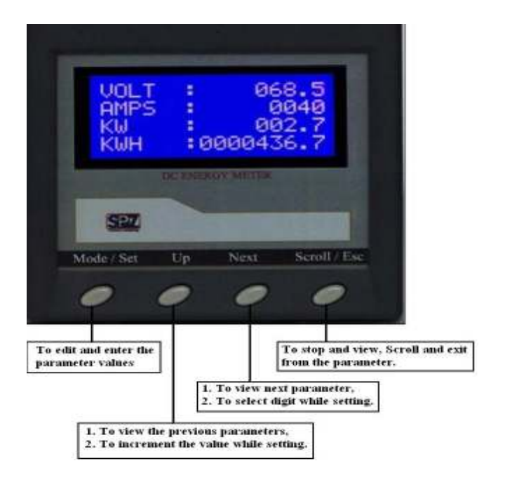
Figure:-key features description